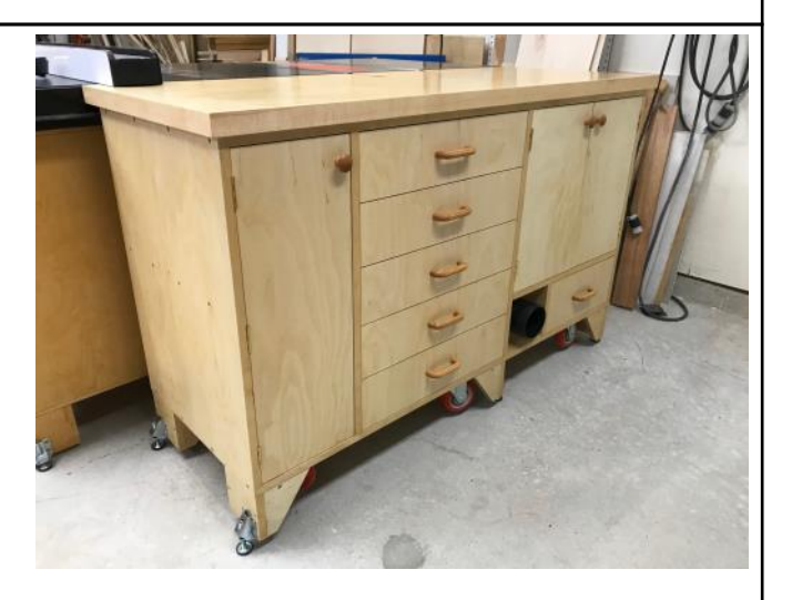
Table saw offcut cabinet. This is a modified version of a Rockler plan. It's made out of 3/4" baltic birch plywood. The drawers are made with Kreg jig butt joints and KV drawer slides. I added a dust port and 4" hose that connects to the saw. The design allows you to dial-in the height with levelers and it also has wheels to easily move around the shop. It's finished with Watco clear danish oil and polyurethane/wax on the top. Finally, I don't have to use an adjustable roller to catch long boards off my table saw! - Sonny Lawson