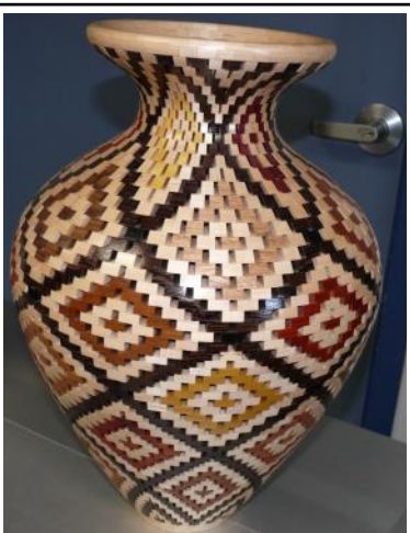
Vase of various woods. — Roy Quast