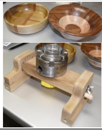
Two bowls and a shop tool. — George Graves