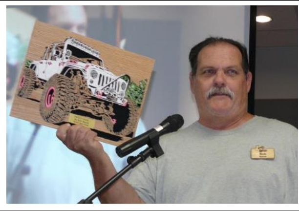
My jeep is 11"x16" cut from wink wood. It is a Charles Dearing pattern. Painted with acrylic paint. Has black velour paper for backer. Sprayed with clear gloss. — Rick Spacek