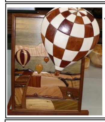
Balloon scene intarsia of 48 woods. — Charles Volek