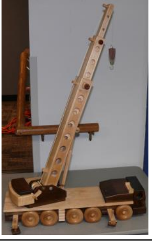
Truck crane of Maple and Walnut. — Bill Hoffmeister