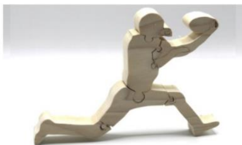
Football Wide Receiver Puzzle