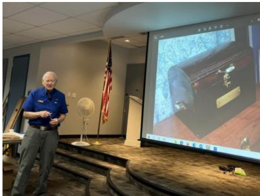
- Toy Chest and Whiskey Decanters made out of Red Oak with Red Mahogany Stain and Wipe-on Poly