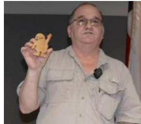
- Scroll Saw Bowl, Basket and Ornaments