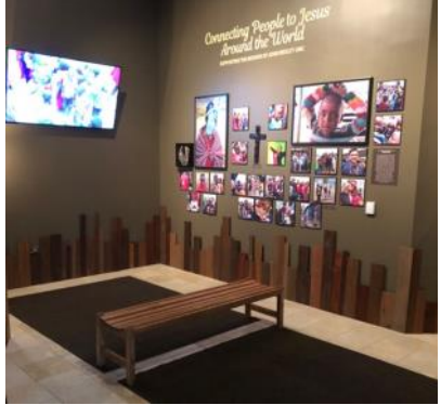
Jack Bailie — Museum Bench made from repurposed Oak.

This one is maple and cherry, about 18" x 12" x 1 1/2", soaked in mineral oil overnight and finished with Walrus Oil wood wax. Pretty good stuff. On delivery I showed him my walnut/curly maple box, and he wanted to buy that, but my wife had laid claim to it, so I told him I'd make him a similair box.