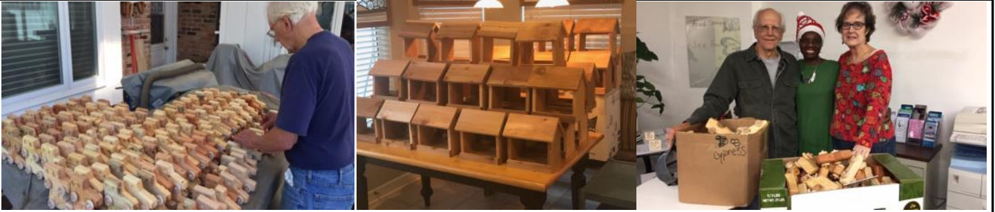
Lon Kelly contributed a fleet of cars and a flock of bird houses.