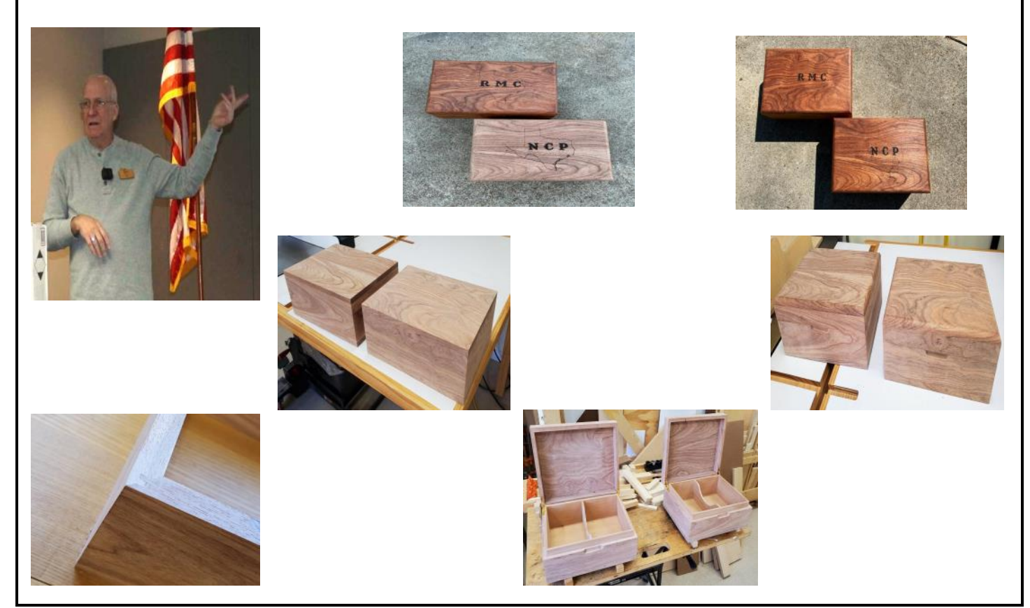
Volume 40 Issue 3

Tom Paulley - Humidors Finished with Odie's Oil