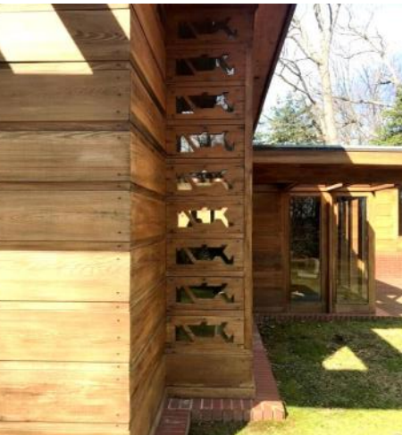
Exterior of home showing small windows with cutouts. The exterior was recently cleaned and treated with a protective coating (not stained).