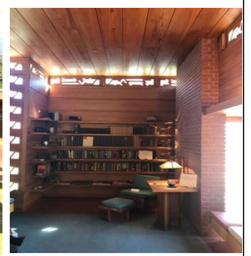
Living room. Note the reflection of the cutouts on the ceiling.