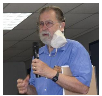
Volume 39 Issue 5