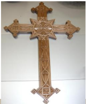
Walt Hansen - Chip carved box and cross of basswood and butternut finished with shellac.