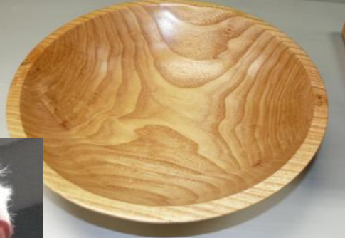
four coats Waterlox.

Dan Schmoker - Bowl of honey locust finished with