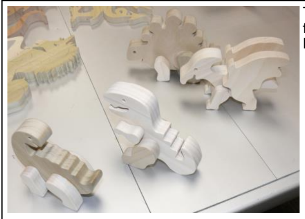
Toy Dinosaurs made from Poplar.