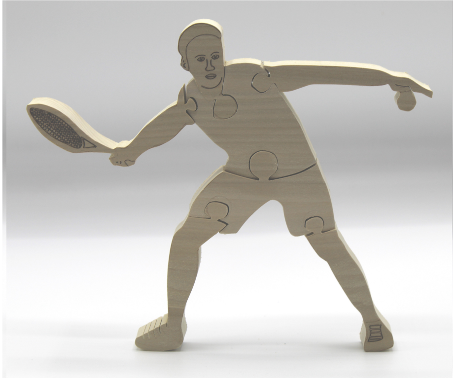
Tennis Player Puzzle