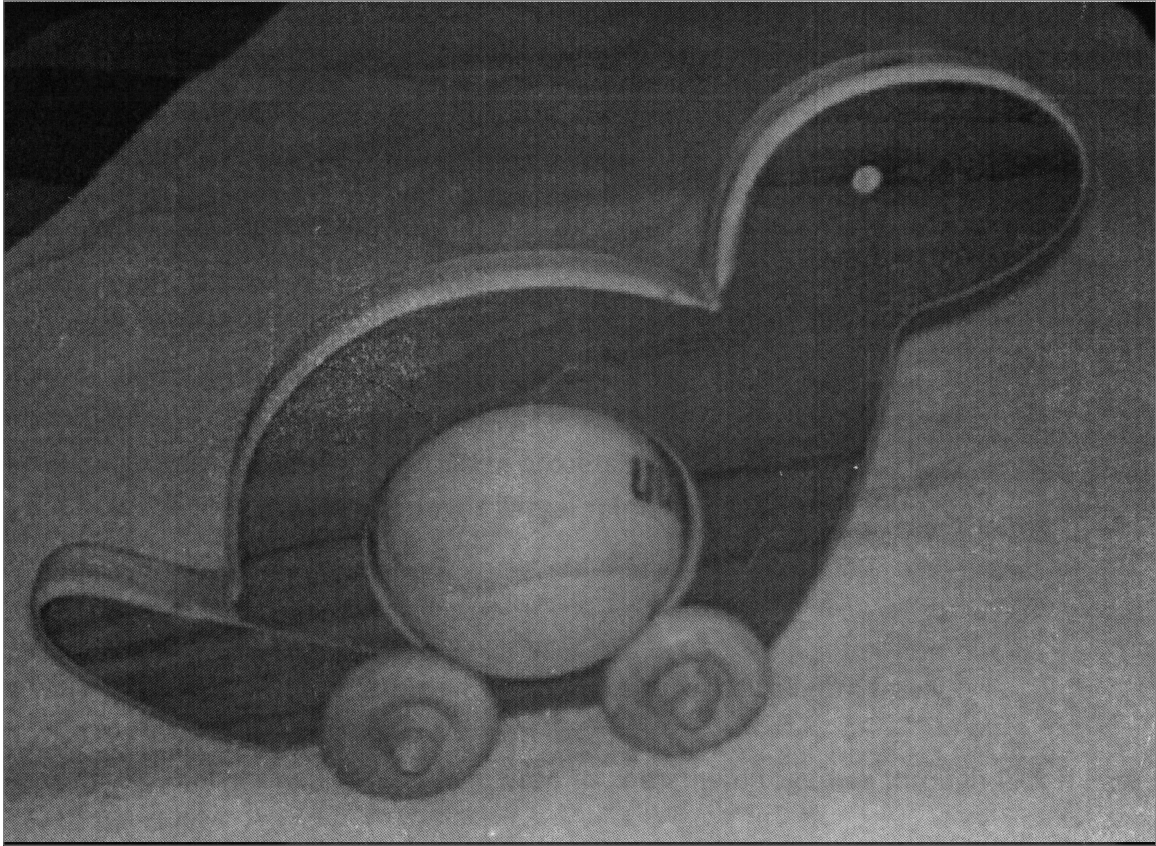
Turbo the Snail