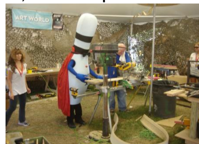
Art World Tent, a top for Big Ben with the travel trunks in the background and note the "special guest" king pin...helping out.