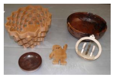
Bill Teague - CNC Coasters