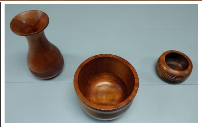
George Graves p ut his lathe to good use turning these three differently shaped vessels.