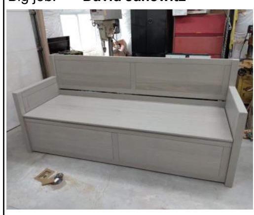
Big job. — David Janowitz

I just finished a large outdoor bench, 8'8" long, 4' tall in the back, 34" deep. For those of you old enough to remember Laugh In, one looks like Edith Ann sitting on it. The seat is also 22" high, without the cushions! Anyway, White Oak, lots of mortise and tenon joints, frame and panel for the solid faces. I used dado grooves in the frames, and just a rabbet on the panels to fit, and space balls to allow expansion. I had to link two bar clamps to glue up the front and back faces, as they are over 8' long. The seat had to hinge, (stainless steel 8' piano hinge,) to allow access to pool valves and a hose, a gas jet, and a dryer vent, (the latter will go out a hole in the right side so not all that hot moist air is inside the bench). With all that stuff below, very little in the rear could be below 22", so I had to build support below the seat from front to back, and added braces with screw slots in the solid 1" thick 98" x 33 1/2" seat, that can rest on the supports. I added a flip up stick in the middle to hold the seat in the up position while working with the stuff below. Finished with 2 coats of Behr premium semi-transparent outdoor stain, supposed to be good for 6 years on decks.