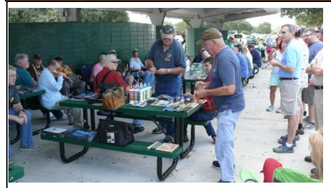
Members enjoying the raffle.