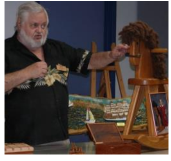
Rocking horse.